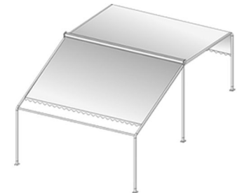
DOUBLE PITCHED, SELF-BEARING